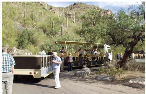
Sabino Canyon Tram Tour