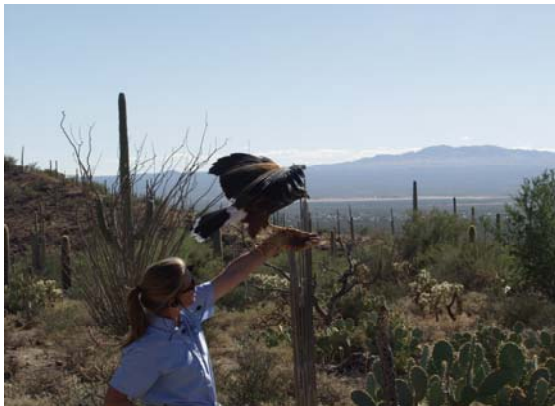
Arizona-Sonora Desert Museum

Be sure to visit the web site at http://www.usafocs1963.org