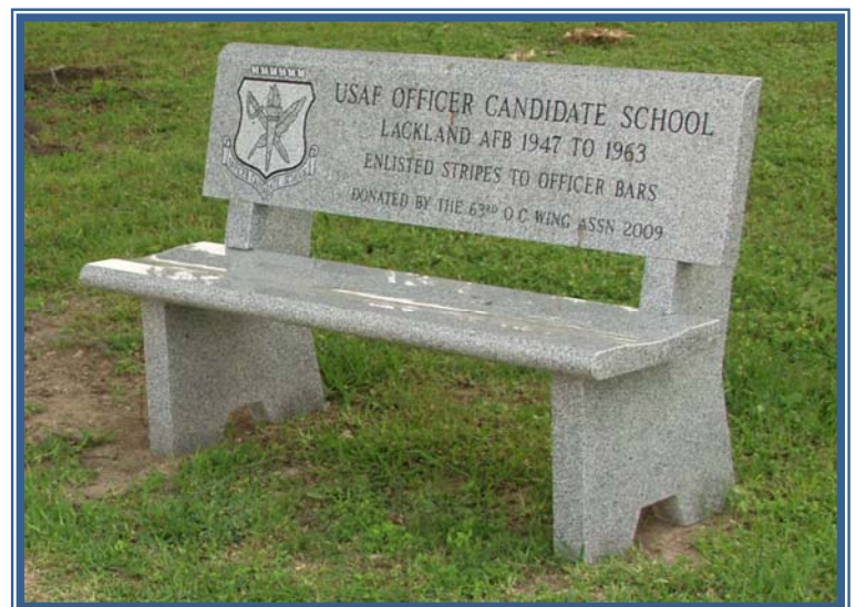
ENLISTED STRIPES TO OFFICER BARS DONATED BY THE 63 RD OC WING ASSN 2009