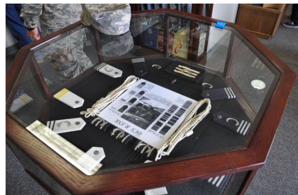
Display highlighting OCS rank