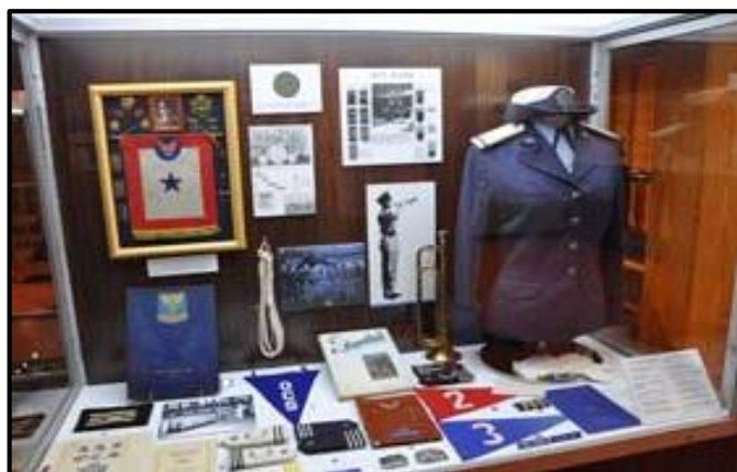
2013 OCS display at USAF Airman Heritage Museum, Lackland AFB.