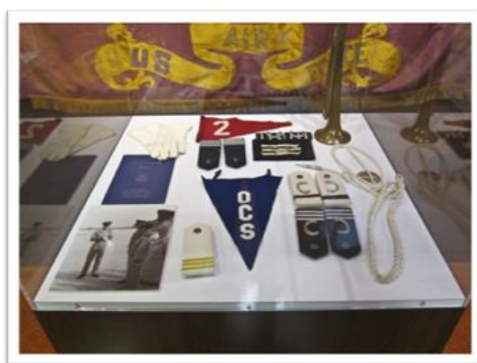
2010 OCS Display at USAF Airman Heritage Museum, Lackland AFB